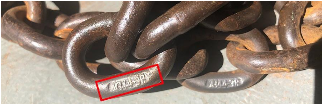
Image 1: The 4344-38 identification marking on this chain means it complies with Australian Standard 4344 and has a 3.8 tonne capacity.